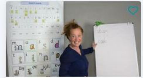
Set 2 spelling - oo (look)