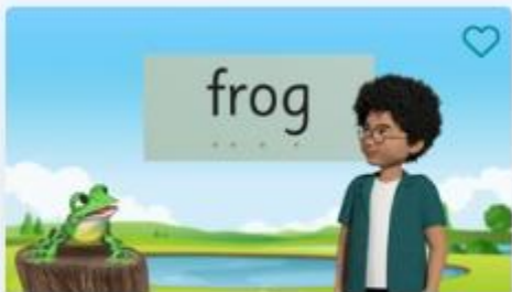
Word Time Fun with Zain 1.7 (6)