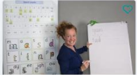
Set 2 spelling - oo (zoo)