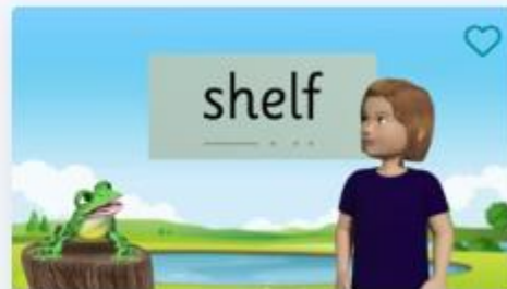
Word Time Fun with Nell 1.7 (9)