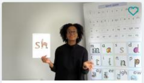
Set 1 Special Friends sh - reading