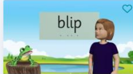
Word Time Fun with Nell 1.7 (5)