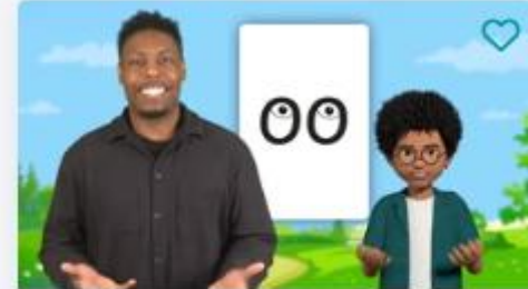
Set 2 reading - oo (look)