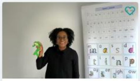
Set 1 Special Friends sh - Fred Talk