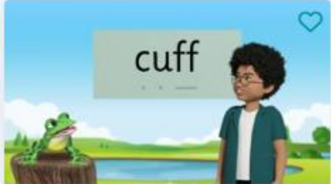
Word Time Fun with Zain 1.7 (2)