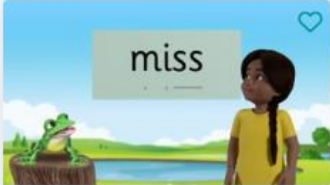
Word Time Fun with Maya 1.7 (3)