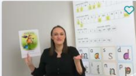
Set 2 reading - oo (zoo)