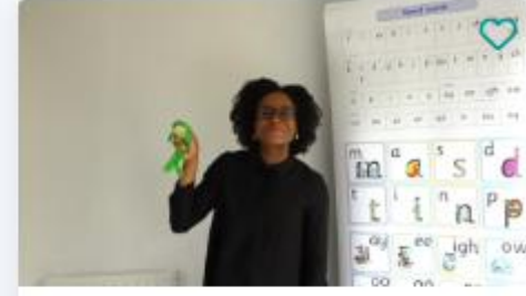
Set 1 Special Friends qu - Fred Talk