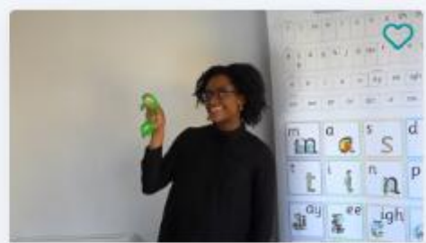
Set 1 ilk