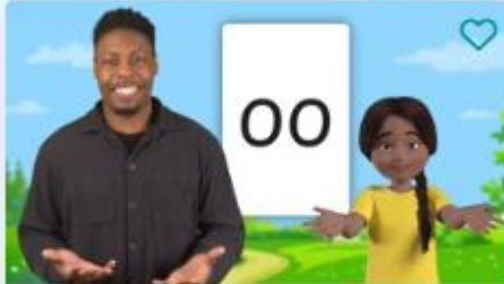
Set 2 reading - oo (zoo)