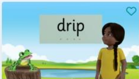
Word Time Fun with Maya 1.7 (7)