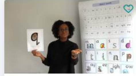
Set 1 Special Friends qu - reading