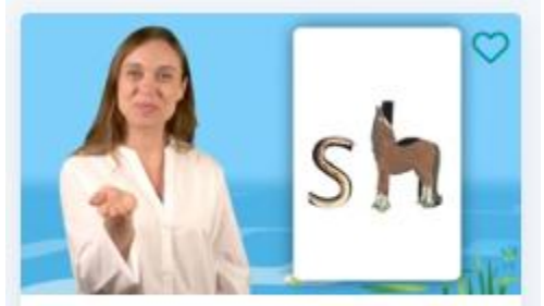
Set 1 Special Friends sh